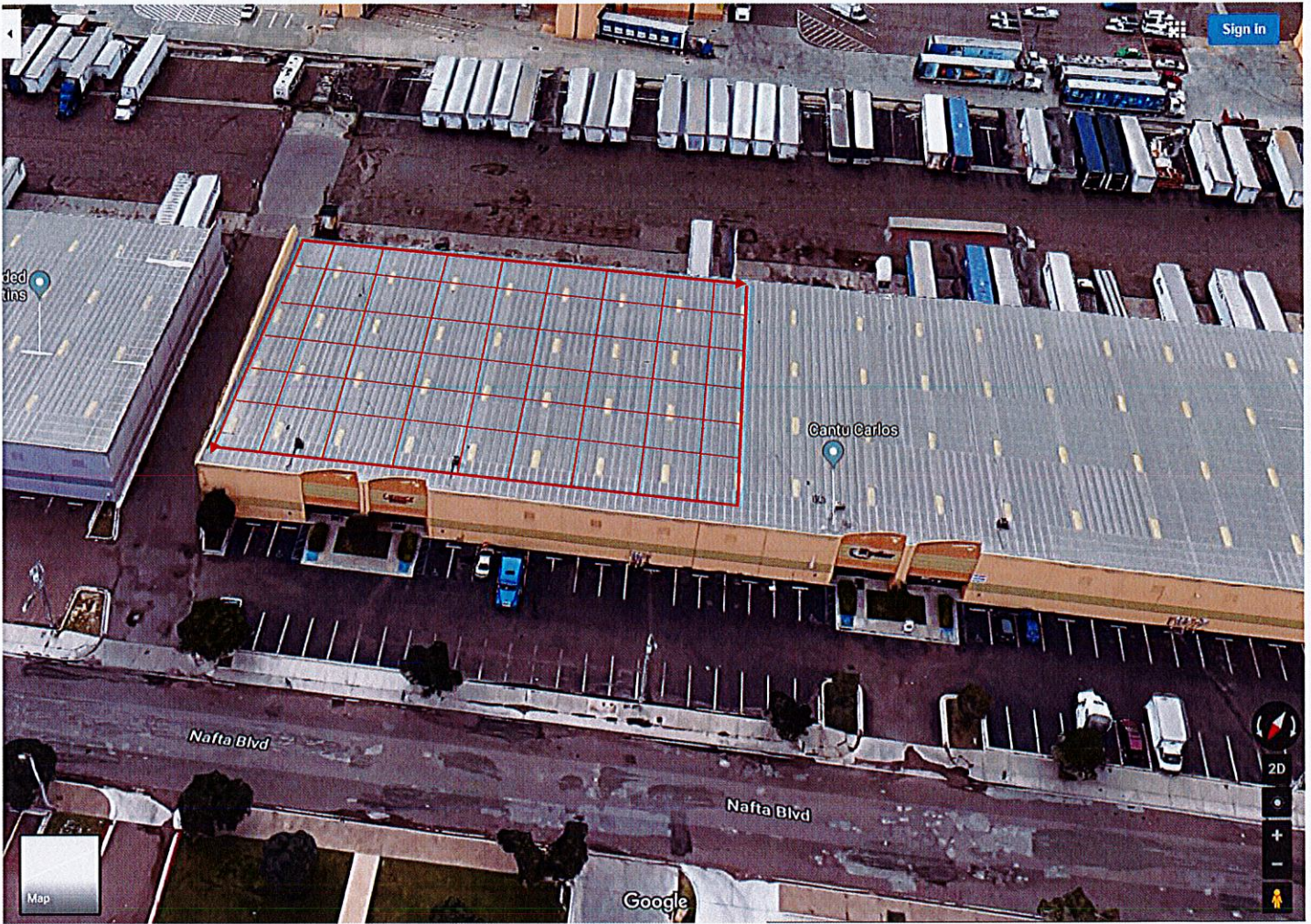
EXHIBIT tabbles A