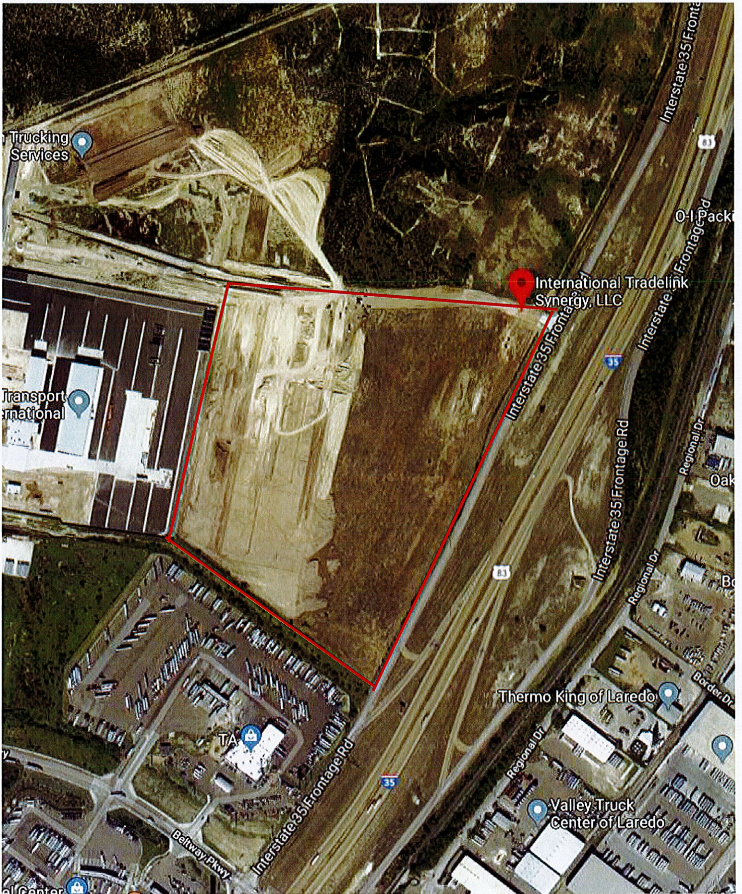
EXHIBIT tabbles A