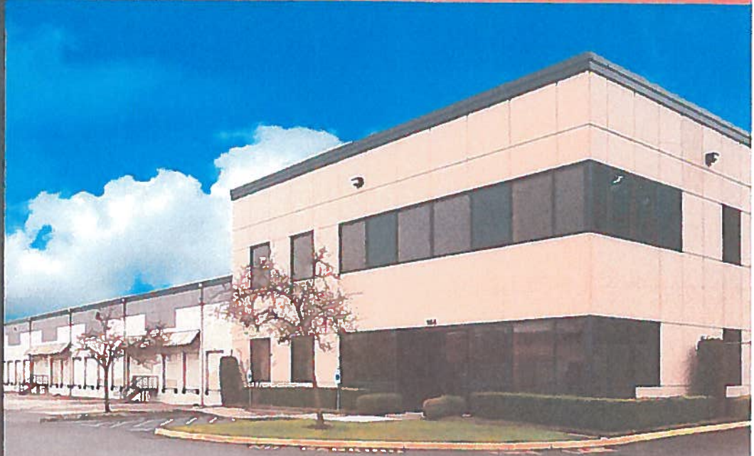
STATE OF THE ART DISTRIBUTION CENTER