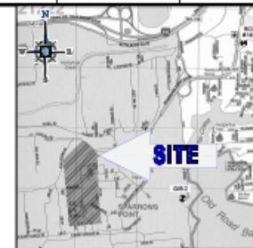
LOCATION MAP CONTRIBUTOR: BOHLER ENGINEERING PROJECT: MAP NO. 28021618 SCALE: 1"=500'